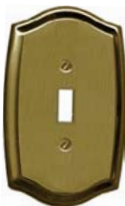
2-1004 Antique Brass T, D, R, TT, RR