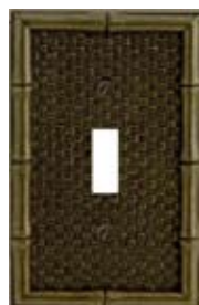
51-"Bamboo Weave" Antique Brass T, D, R, TT