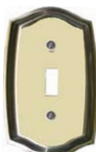
2030 Antiqued Ivory T, D, R, TT, RR