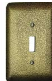
5-934 Weathered Brass T, D, TT