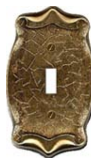
66-Heritage Antique Brass T, D, TT, TD