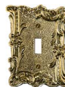
60-Provincial Antique Brass T, D, TT

FOR AVAILABILITY PLEASE NOTE, NOT ALL CONFIGURATIONS ARE AVAILABLE.