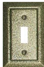
2-409 Weathered Brass T, D, TT