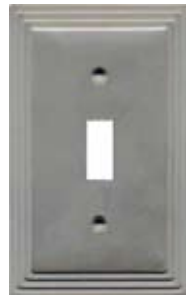
65 "Aztec" Satin Nickel T, D, R, TT