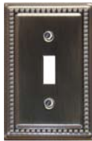
2-220 "Vintage" Antique Satin Nickel T, D, R, TT, RR