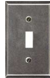
2-167 Traditional Brushed Nickel T, D, R, TT, RR, TTT, RRR

FOR AVAILABILITY PLEASE NOTE, NOT ALL CONFIGURATIONS ARE AVAILABLE.