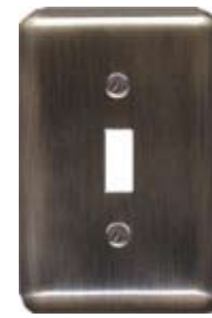
5-810 "Elite" Antique Nickel T, D, R, TT, RR