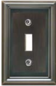
2-201 "Estate" Satin Nickel T, D, R, TT, RR, RRR